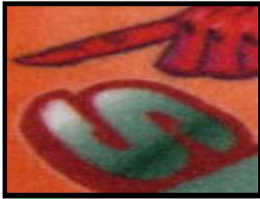
detailview 8 x 6 cm

velvet cutpile gives outstanding colour effects absorbs sand and wetness