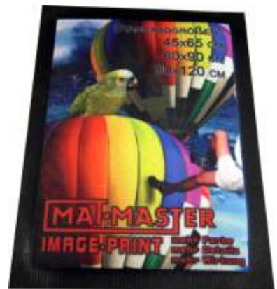
example mat 15 x 20 cm