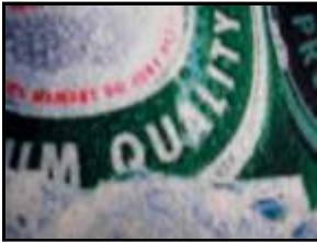
cutout 6 x 4 cm

for short promotion at the POS as long life counter or barnmat can also be used as advertising medium on the wall