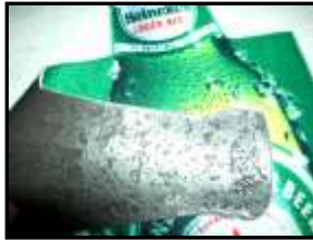
detailview rubber backing

Standard sizes 80 x 120 cm 100 x 145 cm 130 x 180 cm