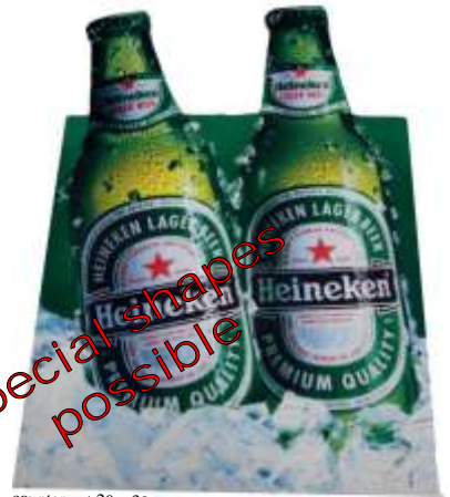
countermat 20 x 30 cm

Standard sizes 80 x 120 cm 100 x 145 cm 130 x 180 cm