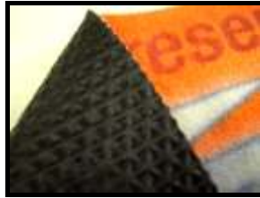
detailview rubber backing