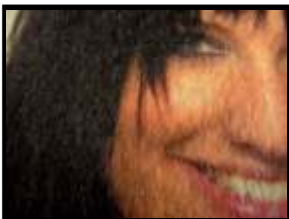
cutout 8 x 6 cm

Standard sizes 80 x 120 cm 100 x 145 cm 130 x 180 cm