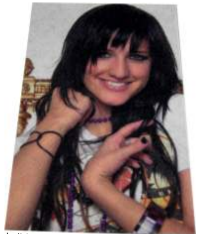
detailview 18 x 30 cm