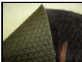
detailview rubber backing