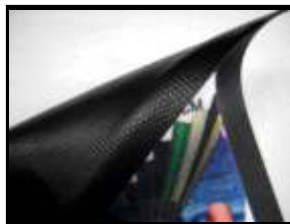
detailview rubber backing