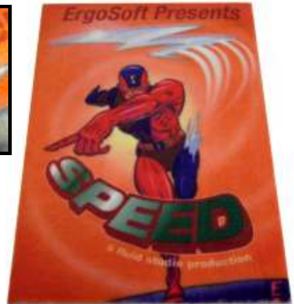
Countermatte 20 x 30 cm